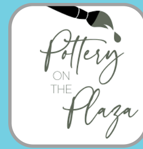
M. $50 Pottery on the Plaza Gift Card