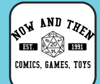
N. $50 Now and Then Gift Card