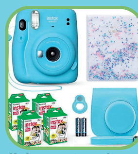
K. Instax Bundle